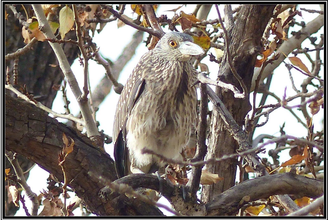
Inglewood Bird Sanctuary in Calgary, AB was host to this out-of-range Yellow-crowned Night-Heron from Oct.5 to 15, 2021. This photo was snapped on a visit there on Oct. 13 by Joan & Malcolm McDonald, who said, “For the last few days it sat in a very visible location allowing many people to get this lifer”.