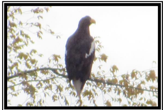
Steller's Sea-Eagle at Falmouth, NS on Nov. 3, 2021