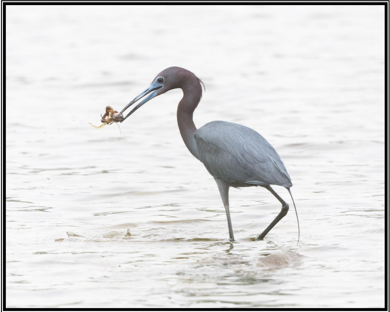
Anthony Kaduck sent along this photo saying: "I am enclosing a photo of Kingston's star bird of 2021: a breeding plumage Little Blue Heron, seen here wrestling with a large crayfish." It was present June 4 & 5, this shot from the 4th.