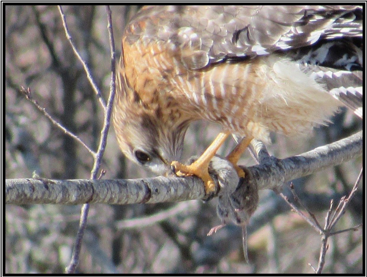
This Red-shouldered Hawk wintered in Brickton, NS and seemed to have no shortage of food, stopping here for a quick bite. A winter season, but not winter (Dec. thru Feb.), bird.