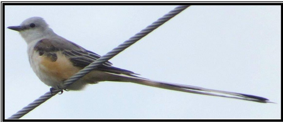
This Scissor-tailed Flycatcher hung out in Liverpool, NS from c. Oct. 28 to at least Nov.3, 2021.