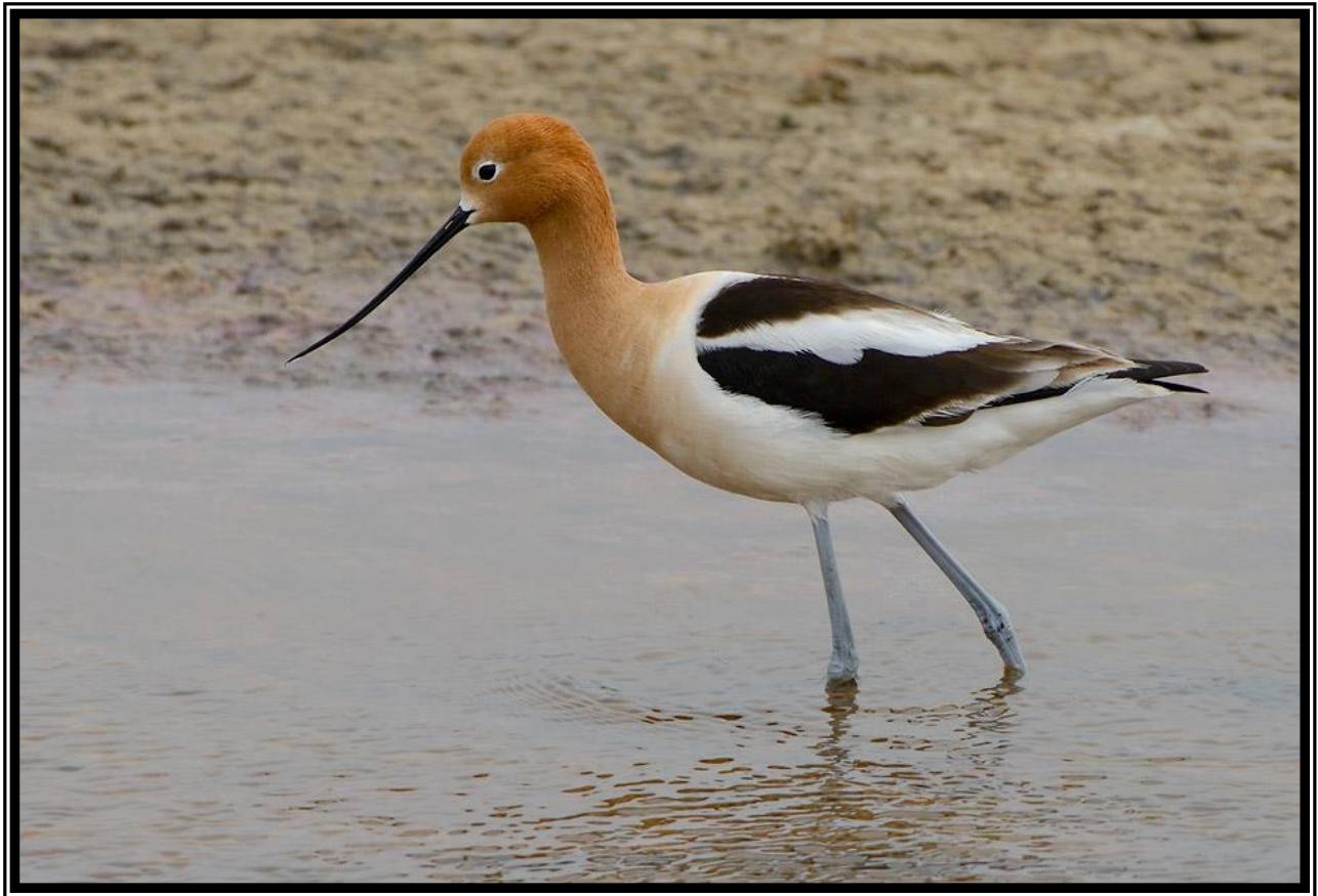
This gorgeous American Avocet was at North, West and East Shoal Lakes IBA, Manitoba, at the northeastern edge of its range, on May 20, 2021.