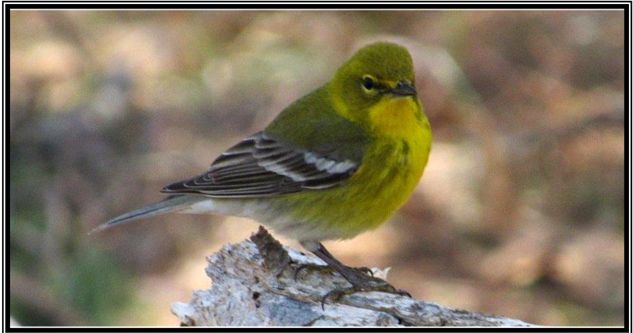
A new breeding bird in NS in the last couple decades, the Pine Warbler is still scarce, but becoming common in areas like the mature pines in the Annapolis Valley; where this bird was imaged on April 15, 2021 in Greenwood, NS.