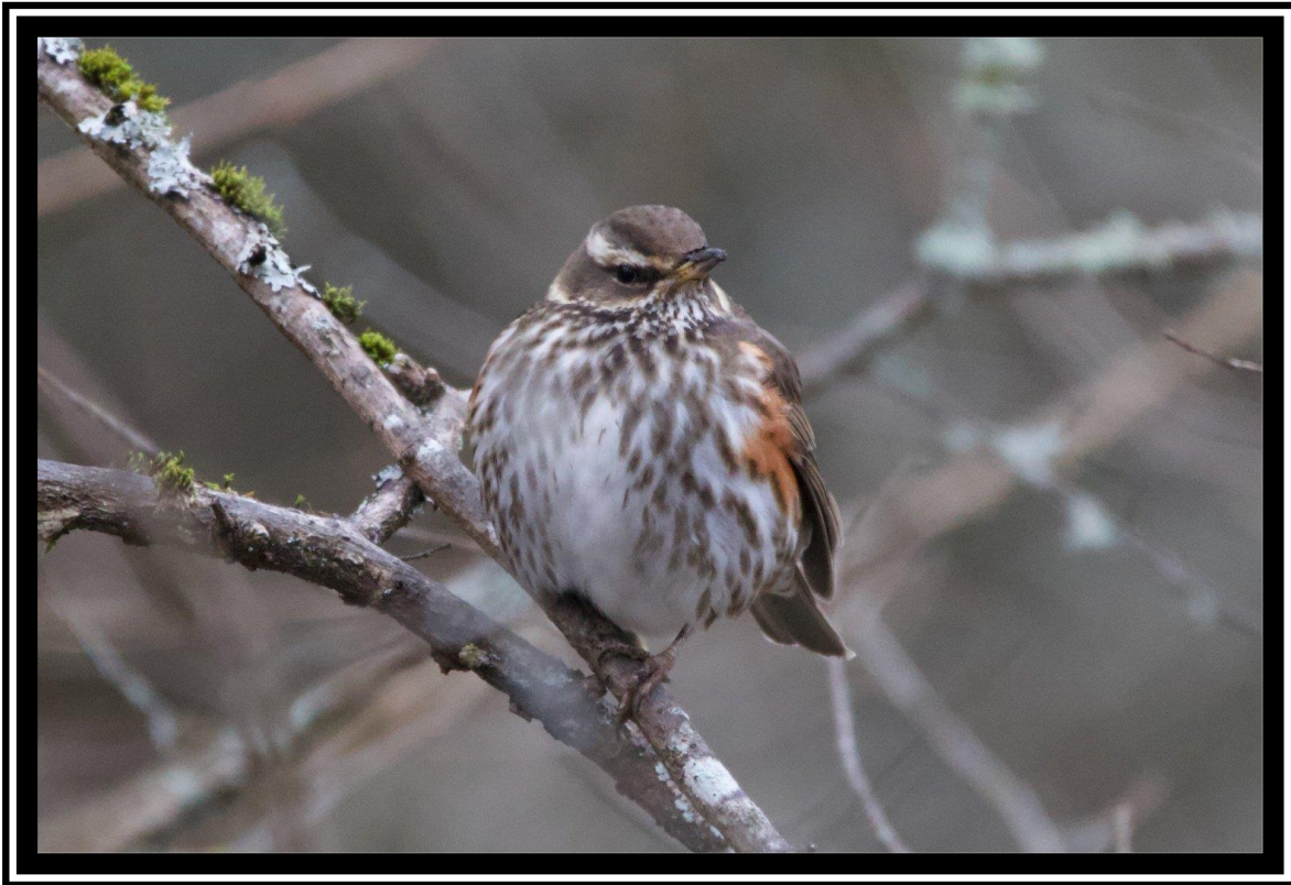
A Redwing on an Feb. 11, 2021 at Victoria, BC