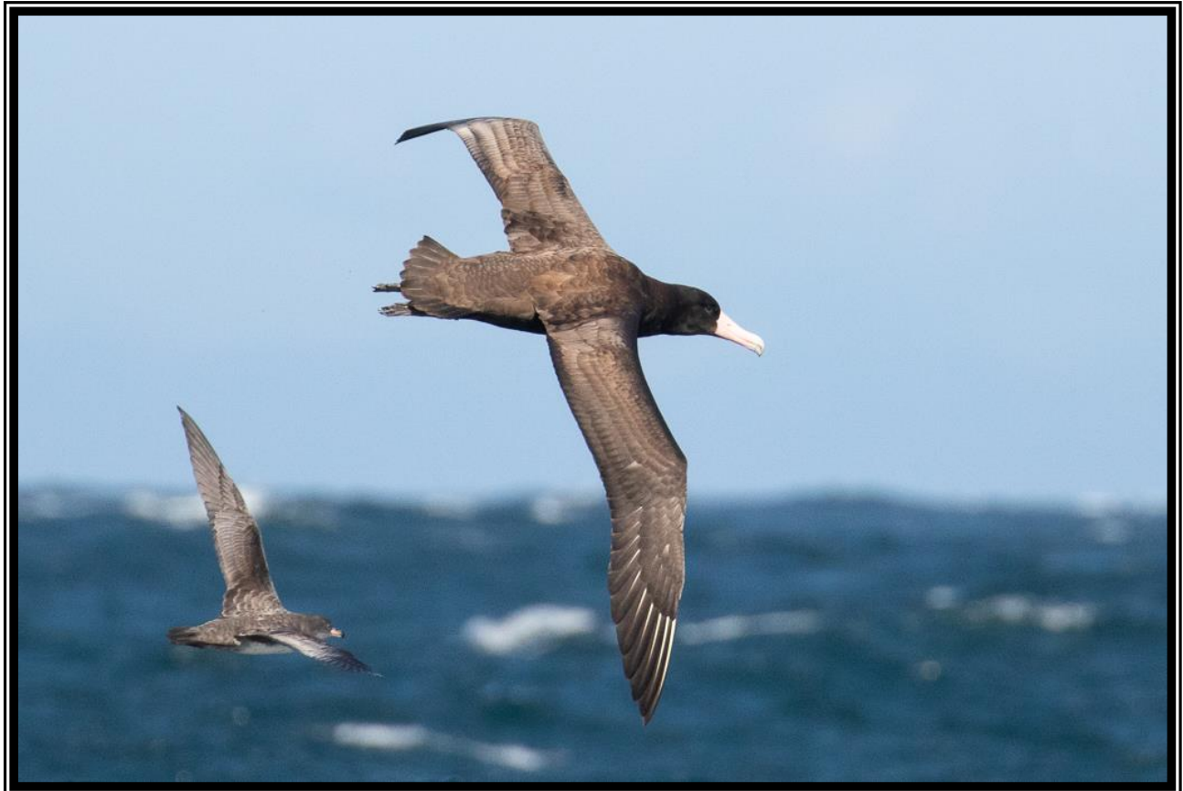
Ilya Povalyaev got a great shot of this Short-tailed Albatross on a pelagic off Tofino, BC on August 29, 2021.

Foreign: In 2021 we had 1 new nation to bring us to 58 foreign country lists: new was Botswana (Burke Korol with 233). There were 78 updates and 17 new to lists were reported on existing foreign lists (25 and 10 for nation lists). Updates were double and new to lists less than a third compared to last year. Some of that can be attributed to lack of travel related to the pandemic and updates accounting for checklist changes. Two existing lists (plus the new list) have new leaders: Burke Korol (Dominican Republic at 123) & (South Africa tied for lead at 556 with Paul Pratt). Additionally, the ACOAT (All 9 Major World Regions Added Together - 5 continental, 3 oceanic and the South Polar Regions) has a new leader: Rolph Davis at 6111; and the eBird Checklist Streak has a new leader: David Bell at 3654.