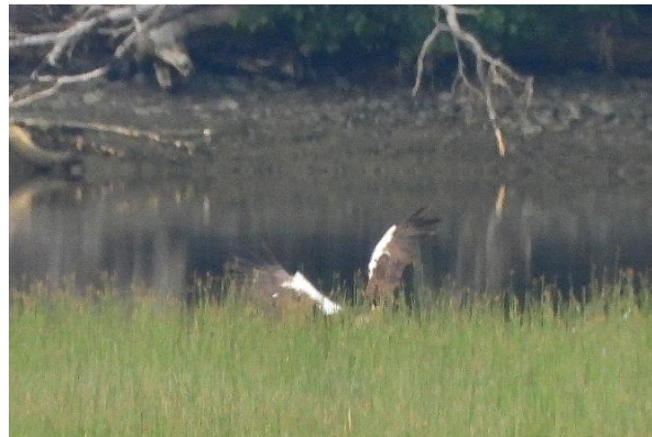
Wings in threat display - Photo M. Jacklin

So, we started for home at 9:15. A bathroom stop at the Drummondville tourist building was next. The friendly woman took our tourist details and asked how many nights we had stayed with them in