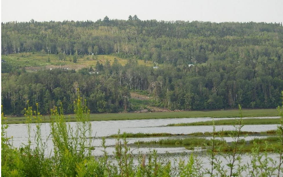
York River Estuary, July 10, 2021