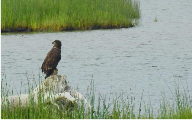
Bald Eagle, July 10, 2021 - Bob Curry

Of course, we watched all day trying a few spots on both sides of the river but saw only Bald Eagles. I did hear a Nelson's Sparrow sing a few times. Small compensation.