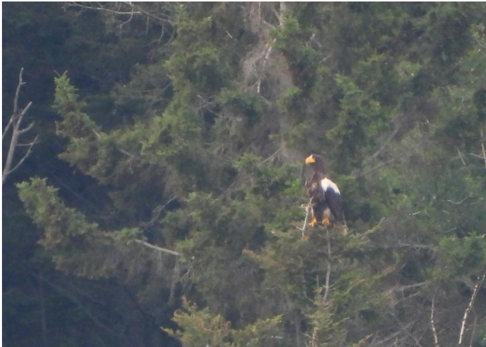
Steller's Sea-Eagle, July 11, 2021, Wakeham, QC