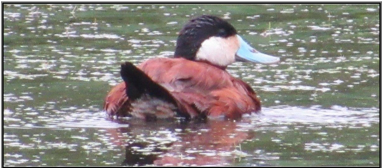
A Ruddy Duck was at the French Basin Trail in Annapolis Royal, NS.