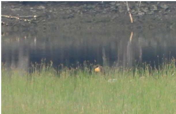
Head and bill

At 8:40 we started to pack up when a woman with her teen son arrived, desperate to see the bird. We got the scope back out got them on it and just then the bird flew. What a striking brown and white image it was. It flew in a long glide down river to a spot on the river mostly obscured by marsh grasses. Seven Bald Eagles flushed in all directions like flies from a scat then began to dive at the Steller's that was now standing on the mud. This dive-bombing went on for several minutes as the usurped eagles harassed "the king", which spread its huge wings aggressively, the white upper wing coverts flashing in the sunlight. Surely screams must have accompanied these actions. The lesser eagles peeled off leaving the Steller's to eat what we presumed was a large dead salmon. With its head down we could no longer see it. How privileged we were to have seen this action.