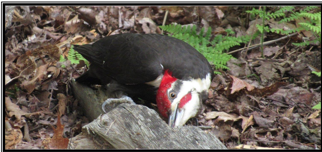
This contortionist Pileated Woodpecker at Halifax, NS on June 14, 2021.