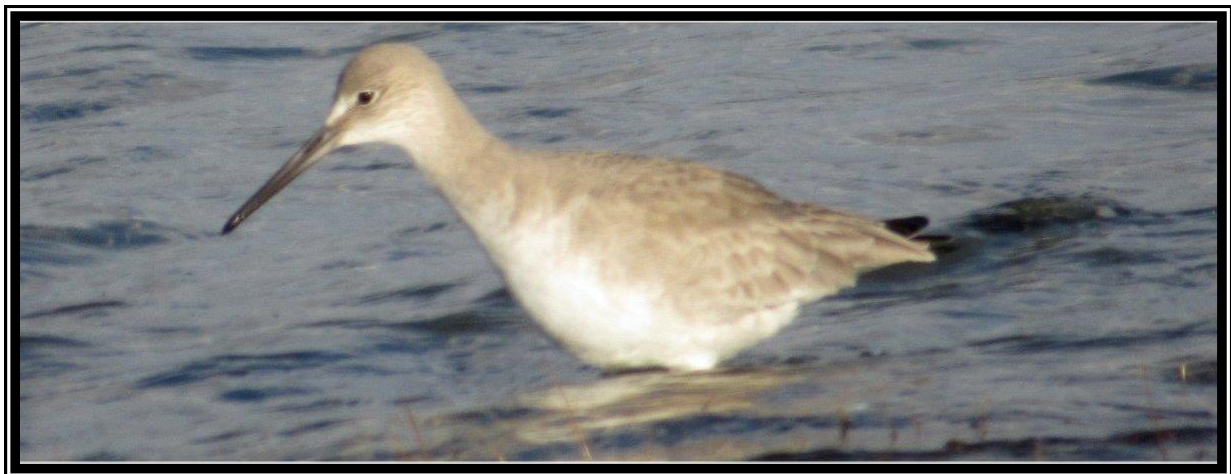
This "Western" Willet wintering at Crescent Beach, NS was snapped on Feb. 25, 2021