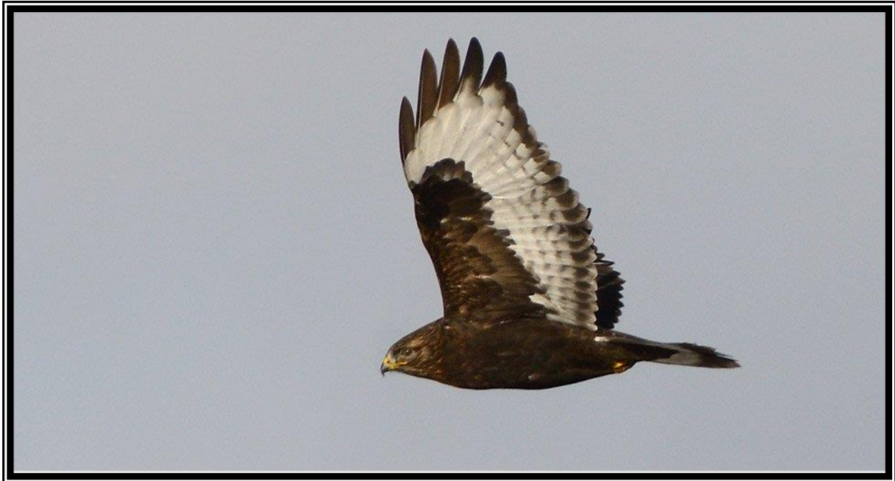
Garry Budyk caught this gorgeous dark phase Rough-legged Hawk in the Zhoda area, MB on December 2, 2021.